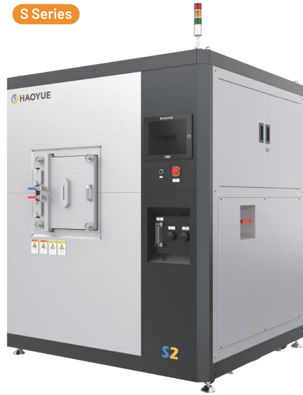
S2 Isometric View