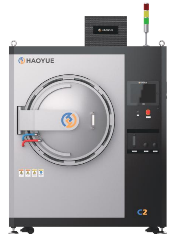
C2 Front View

Chemical vapor deposition furnaces (silicon carbide) can be used for surface oxidation resistant coatings and matrix modification of materials using silane as the gas source. Vertical chemical vapor deposition furnace (sedimentary carbon) can be used for materials using hydrocarbon gases (such as C 3 H 8 , CH 4 , etc.) as carbon sources. Surface or substrate isothermal CVD/CVI treatment. Horizontal chemical vapor deposition furnaces (SiC, BN) can be used for surface coating of materials, matrix modification, composite material preparation, etc..Substrates for epitaxial wafers, high-temperature refractory materials for crystal furnaces, hot bending molds, semiconductor crucibles, ceramic based composite materials, etc.