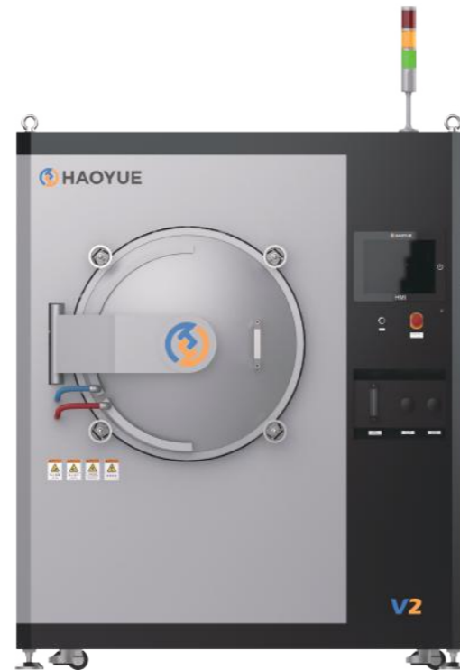
V2 Front View