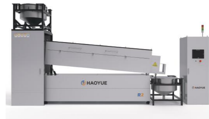
R2 Front View