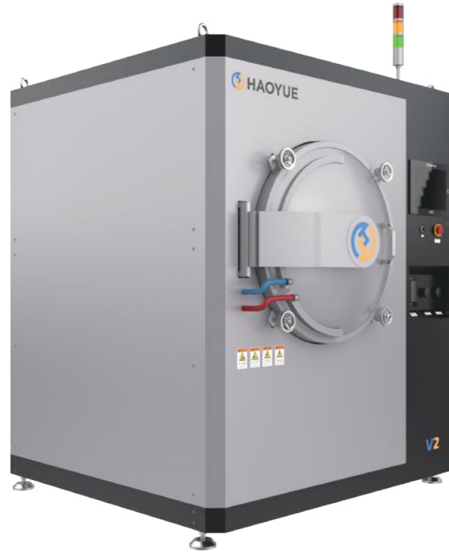
V2 Isometric View