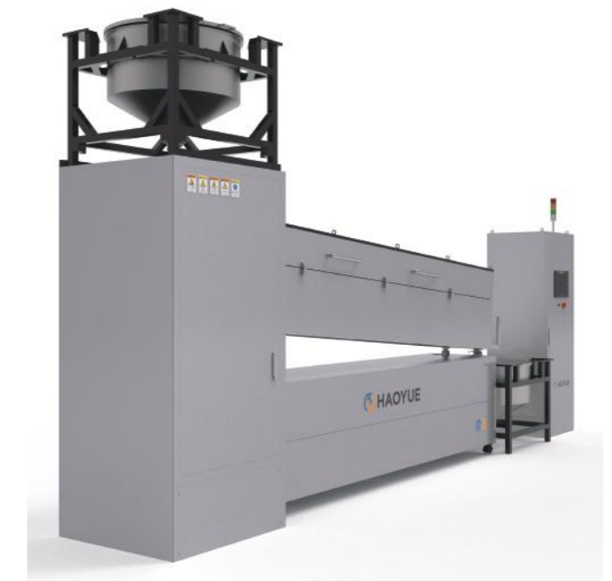
R2 Isometric View

The sintering process has been widely used in many industrial industries such as steel industry, metallurgical industry, ceramic industry, etc., such as cemented carbide, ceramics, refractories, powder metallurgy, ultra-high temperature material, etc..