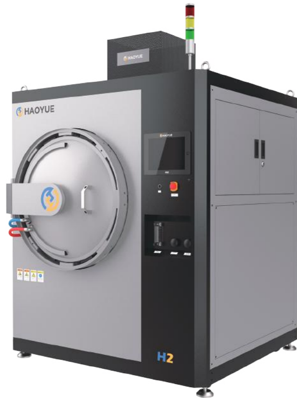
H2 Isometric View