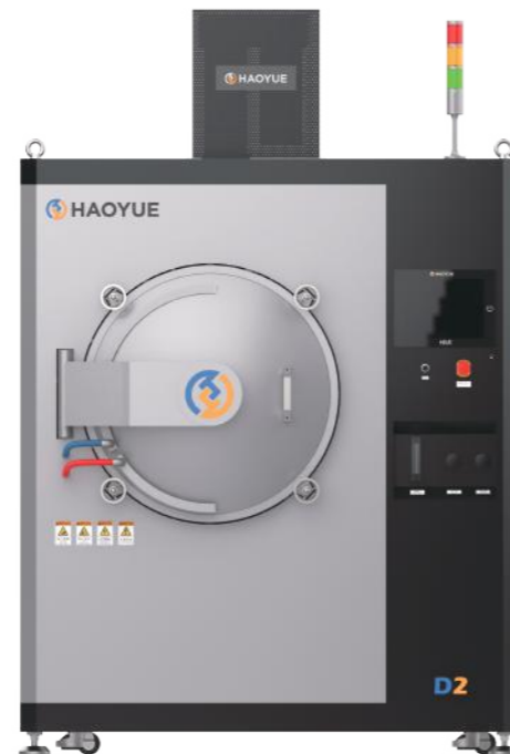
D2 Front View