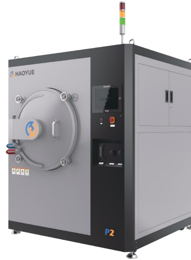
P2 Isometric View