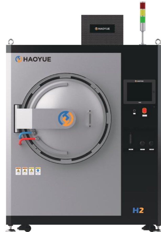
H2 Front View

Equipment for annealing and purifying metal parts used for ceramic sintering or metalization, brazing, and sealing of glass parts. Mainly used for heat treatment of tool steel, mold steel, high-speed steel, ultra-high strength steel, magnetic materials, stainless steel, non-ferrous metals and other materials in a hydrogen atmosphere.