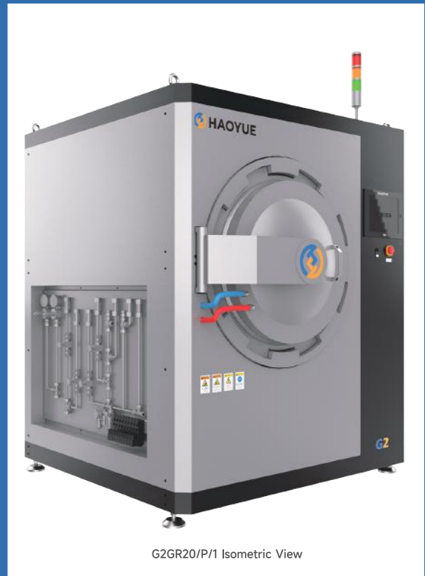
G2GR20/P/1 Isometric View

Gas pressure sintering refers to the sintering process first carried out under low pressure, followed by sintering the material to reach a fatigue state under normal pressure, and then sintering under high pressure (the result is further increasing the fatigue state of the material and quickly eliminating stress in the material). After the high-temperature and high-pressure sintering process, the material's mechanical properties (hardness, strength, toughness, etc.) are superior to ordinary sintering processes in all aspects.