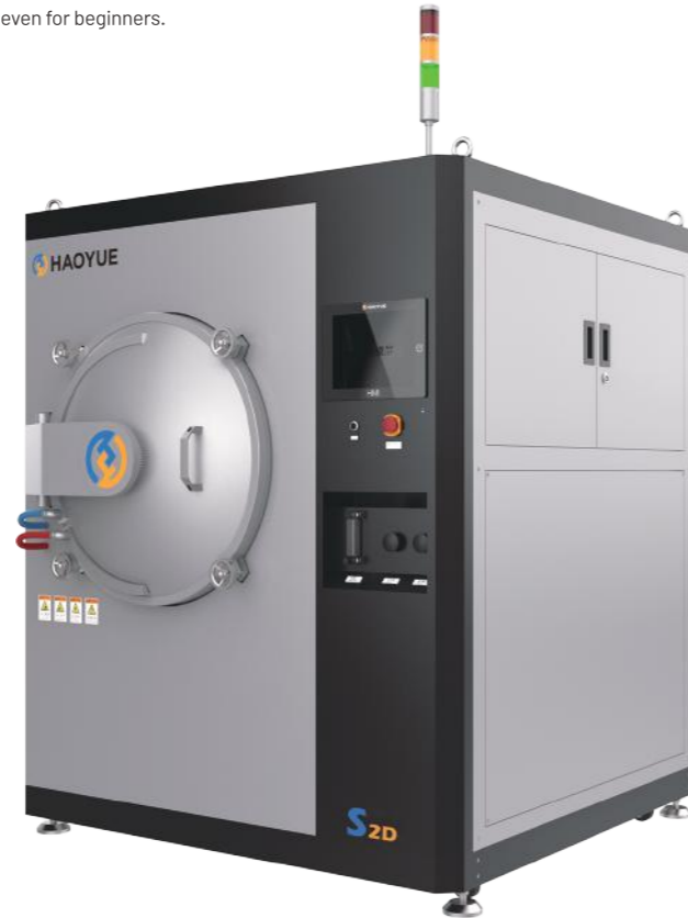
S2D Isometric View