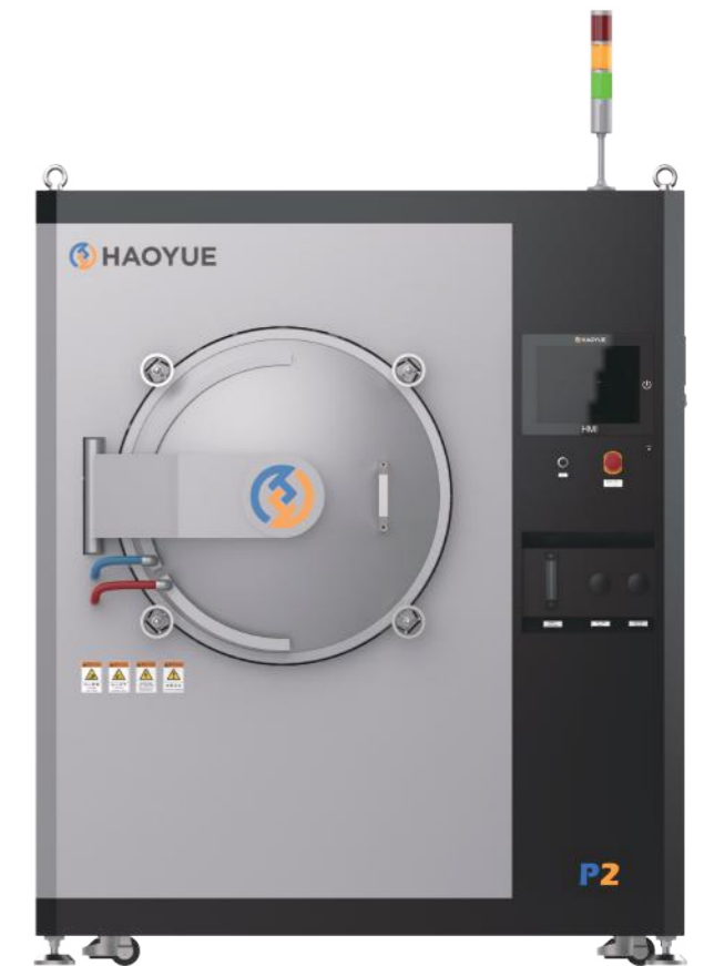
P2 Front View