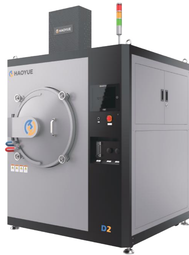
D2 Isometric View