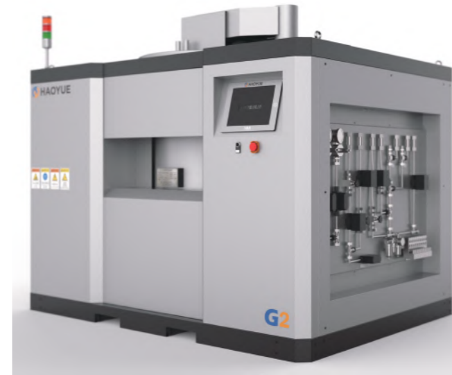
G2GR20/10 Isometric View