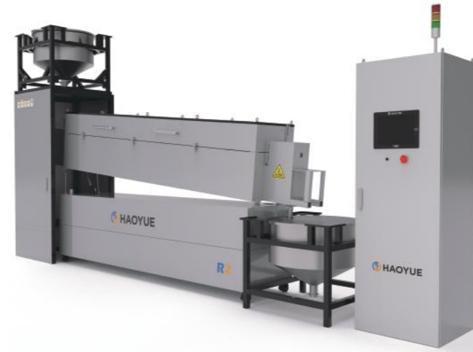
R2 Isometric View