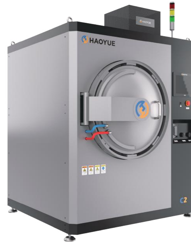
C2 Isometric View